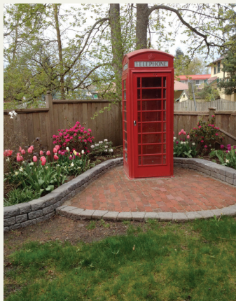
Current location: Bill's garden, Surrey, British Columbia, Canada